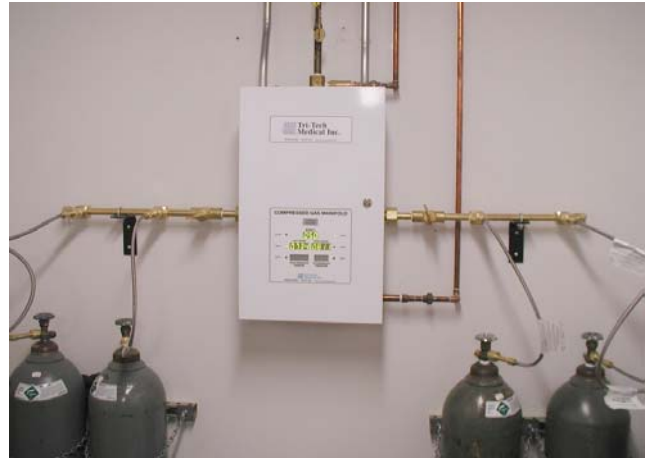
Model CCU12CO1W0202B shown above

The header bars shall be equipped with emergency high pressure shutoff valves outside the cabinet to allow for emergency isolation of the header bars. The header bar shall incorporate integral check valves for each station.