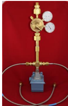
Model TSDWPHP-580 with PS-160-3200 pressure switch shown with optional pressure switch above