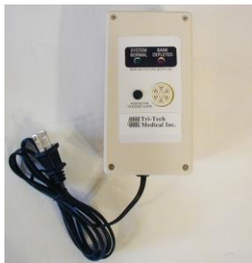
Model TAV-1 Shown above Optional remote audio visual alarm must be used with optional pressure switch

Ideal for veterinary applications where manual switching of cylinders and a possible interruption of gas service are allowable. Systems are available for nitrous oxide, carbon dioxide, nitrogen, medical air and oxygen